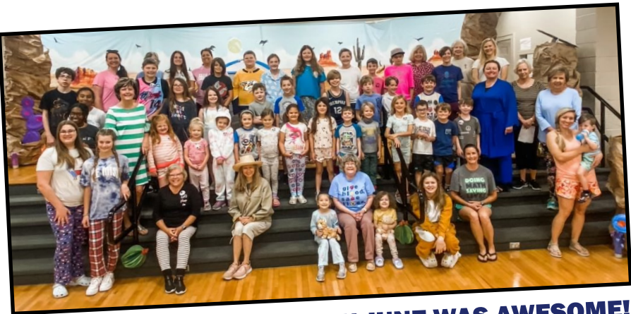
OUR “MONUMENTAL” VBS IN JUNE WAS AWESOME!