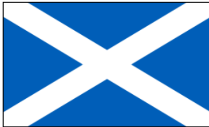
Cross of Saint Andrew