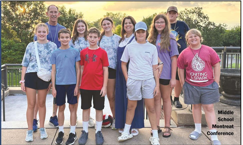
Middle School Montreat Conference

CONTINUED FROM PAGE 12 activities and music! We also have an exciting, activity filled, and God focused Vacation Bible School during the summer. We will be looking to adding Summer Wednesday Night Activities for the children. Our Youth Program includes Sunday School, Wednesday Night Small Group, and Sunday Night Games & Bible Study. We offer studies to build faith, opportunities to learn through challenging discussions, a lot of fun and games, as well as many opportunities to serve the community. Our Youth program includes Montreat summer conferences, weekend trips, concerts, summer camps and retreats at NaCoMe. Christian Education looks for opportunities to actively include our children and youth in our Sunday worship services through Youth Sunday, having our children serve as cross bearers and being Acolytes (lighting the candles), Liturgists, and many other opportunities. We treasure our babies and provide a safe, clean nursery staffed with loving caregivers. We seek to provide a staffed nursery for all church events. CE is committed to making sure our entire congregation is learning the Gospel in new, fun, insightful, and exciting ways while strengthening the body of Christ.