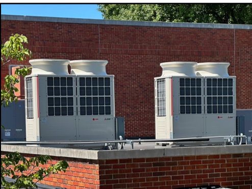
BELOW: Air compressors that are part of our new HVAC system

CONTINUED FROM PAGE 6 us by the congregation over time. Over the years, the committee has encountered significant challenges in maintaining our beautiful buildings and campus, and this year has been no exception. This spring, a significant leak in the old boiler/chiller system was discovered, prompting the need to move forward quickly with the HVAC replacement project that the committee had been working on for over a year. Once completed, we will enjoy a state-of-the-art system in our Sanctuary and Education Buildings.