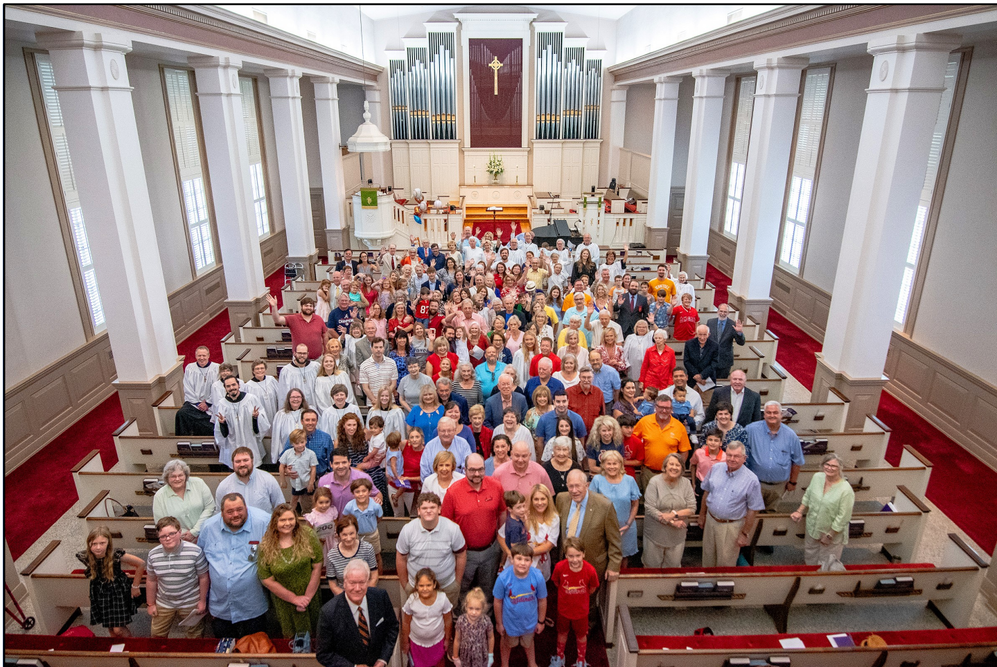
The congregation on Rally Day, August 13, 2023

CONTRIBUTE TO THE NEEDS OF THE SAINTS AND SEEK TO SHOW HOSPITALITY.