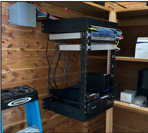
ABOVE: Part of our new IT system housed in Memorial Hall