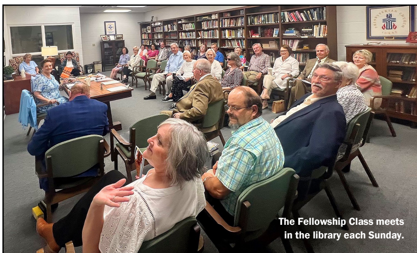
The Fellowship Class meets in the library each Sunday.