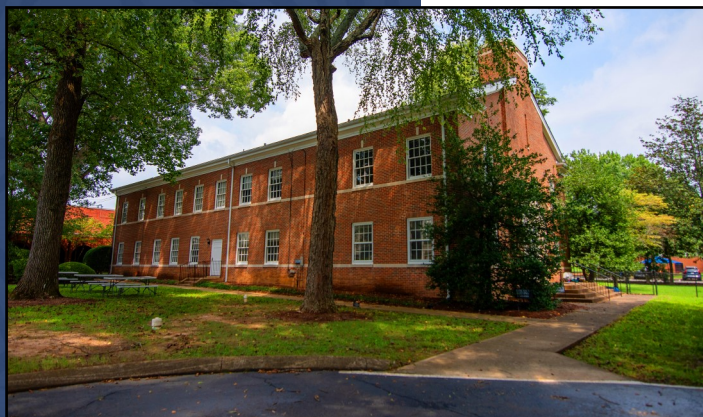
ABOVE: The FPC Education Building