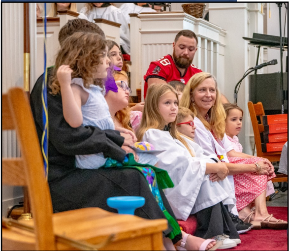
Time with the Children is a fun part of our weekly Worship Services.

CONTINUED FROM PAGE 8 aspiration of enhancing our church's general marketing and visibility, aiming to connect with a wider audience.