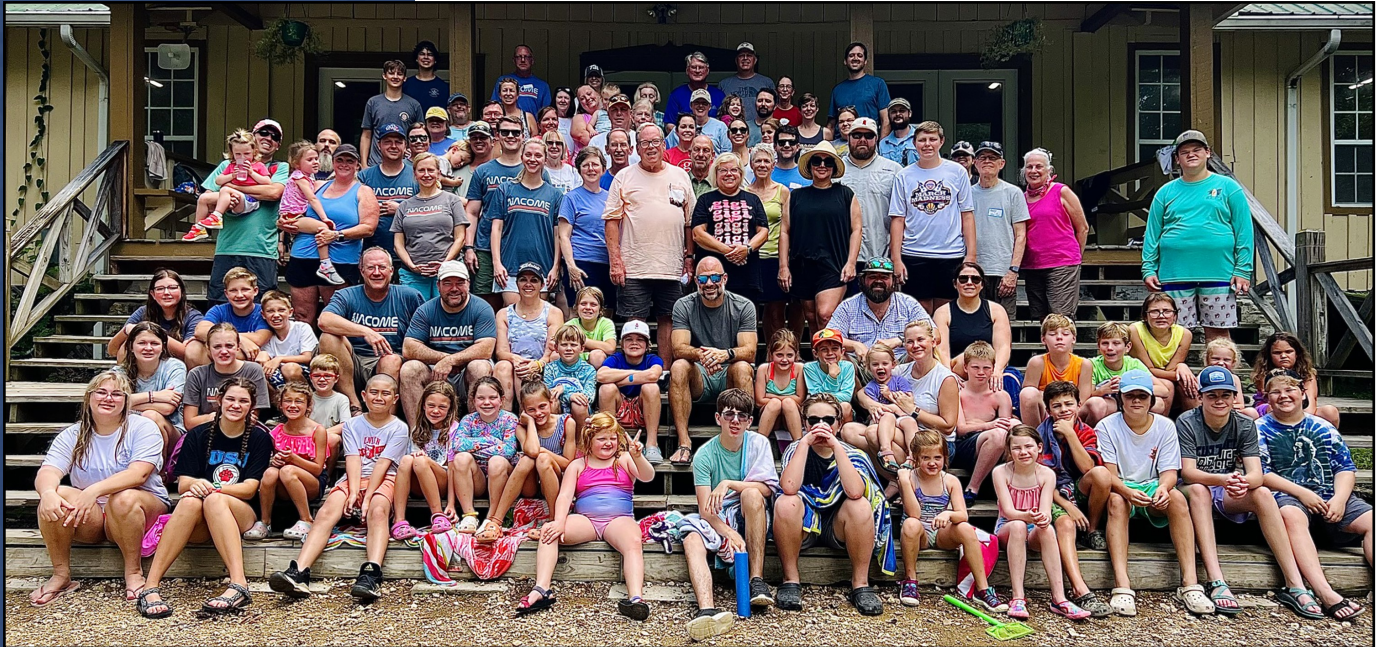
ABOVE: 2023 NaCoMe Family Camp BELOW LEFT: Hayride at our annual Funny Bones event.

BUT IF WE WALK IN THE LIGHT, AS HE HIMSELF IS IN THE LIGHT, WE HAVE FELLOWSHIP WITH ONE ANOTHER, AND THE BLOOD OF JESUS, HIS SON, CLEANSES US FROM ALL SIN.