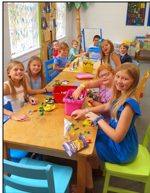
Rotation Sunday School

encourages our congregation to study, share and teach; providing a variety of opportunities to learn and grow in God's Word. Christian Education Committee has a broad range of responsibilities. Our Adult Education includes providing curriculum and teachers for a variety of Sunday School Classes and Wednesday Night Small Groups. Our Adult Education programs are committed to classes that study God's Word and how it applies to our lives. Our Small Groups are building strong bonds between our church family members while growing faithful disciples. Christian Education takes very seriously Proverbs 22:6 "Train a child in the way he should go and when he